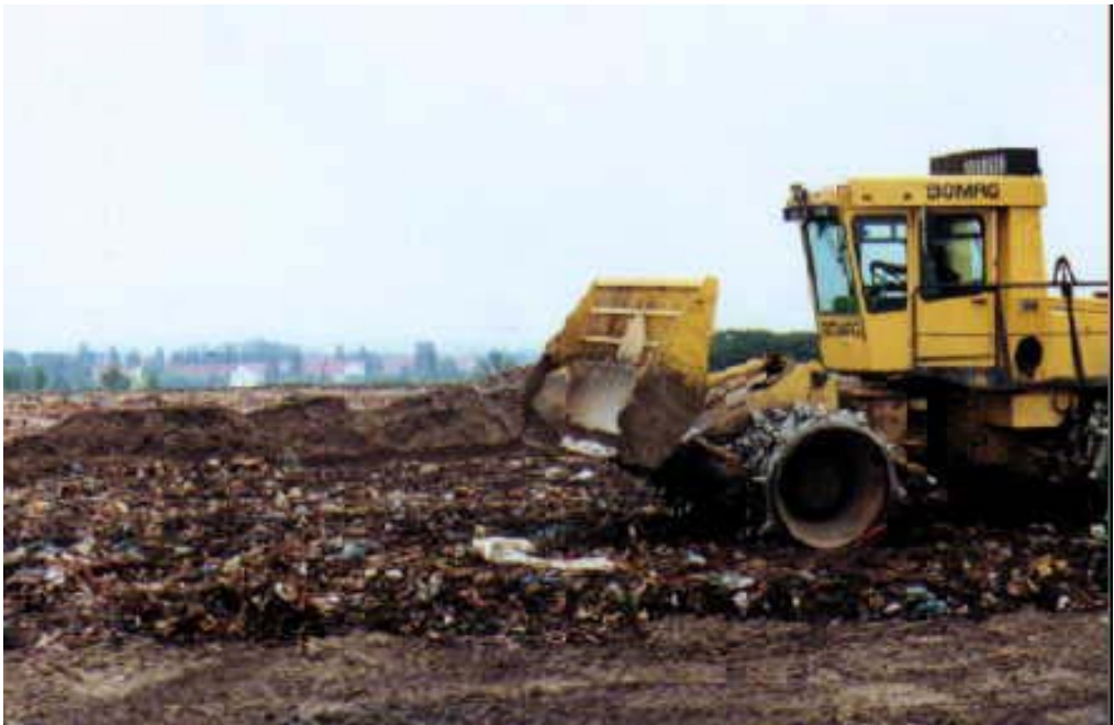
Figure 1: MSW in the landfill, biologically pretreated (below) and untreated (above)