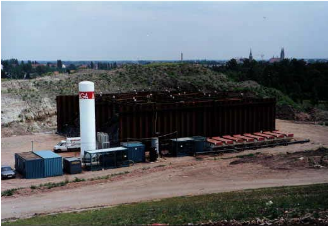
Figure 5: Bioposter pretreatment plant at Stendal (Germany)